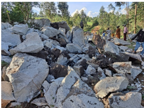
The broken debris of rocks clearing a path for motorists.

On 24 February 2026, AfriNov supported the Nandi Women Network in North rift region to conduct a community civic education forum in Kaptumo/Kaboi Ward, Aldai Sub-County. The forum brought together community members, local leaders and civil society actors in a structured dialogue aimed at surfacing grassroots priorities and strengthening the social contract between citizens and their elected representatives. AfriNov offered financial and technical support that ensured an effective and fruitful discussions.