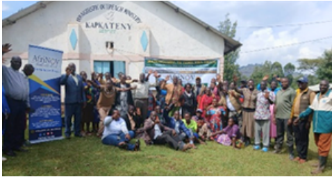
Community peace dialogue in Mt. Elgon convened by AfriNov.