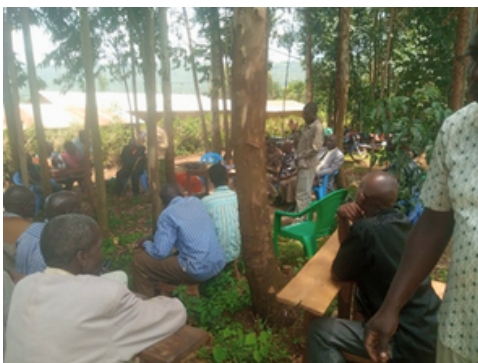
Community dialogue in Ndaret hosted by Kapkateny peace Initiative.

On 20 February, AfriNov supported the Kapkateny Peace Initiative in Mt. Elgon to convene a community peace dialogue. The dialogue was about coexistence, choosing understanding over division and committing, together, to a future grounded in stability and mutual respect. In this forum, apart from financial support AfriNov provided moderation and technical support.