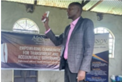
Community civic education forum in Kaptumo/Kaboi Ward by Nandi Women Network supported by AfriNov.